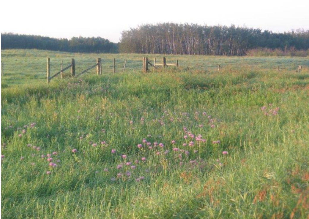
Figure 1. Field site in the gray-black soil transition zone.

In a study published in Soil Biology and Biochemistry in 2014 , a group of Canadian researchers from across the Prairies determined the structure of AMF communities in 78 conventional and 72 organic wheat fields and related this to wheat growth and nutrient uptake efficiency (Figure 1). The AMF communities were described by 454 pyrosequencing. Plant Root Simulator (PRS™) probes were used to determine soil nutrient supply rates of N, P, K, S, Ca, Mg, Cu, Zn, Fe, Mn and B in soil samples obtained after seeding (early June). Samples were wetted to field capacity and PRS probes were installed for one day at room temperature. Wheat biomass and nutrient concentrations were determined at anthesis and maturity. Plant roots were examined to determine the colonization by mycorrhizae.